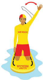
9. Assistance required