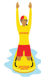
11. Emergency evacuation alarm