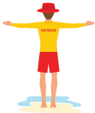
5. Remain stationary