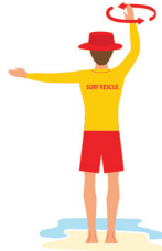
2. Pick up swimmers