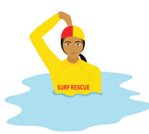
13. All clear/ok