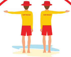
4. Go the right or to the left