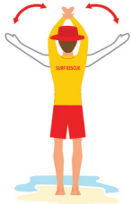
1. Attract attention