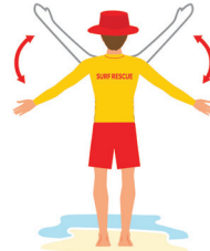
7. Pick up or adjust buoys