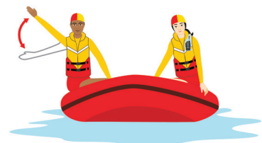
14. Powercraft wishes to return to shore