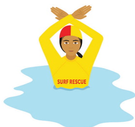
12. Submerged victim missing