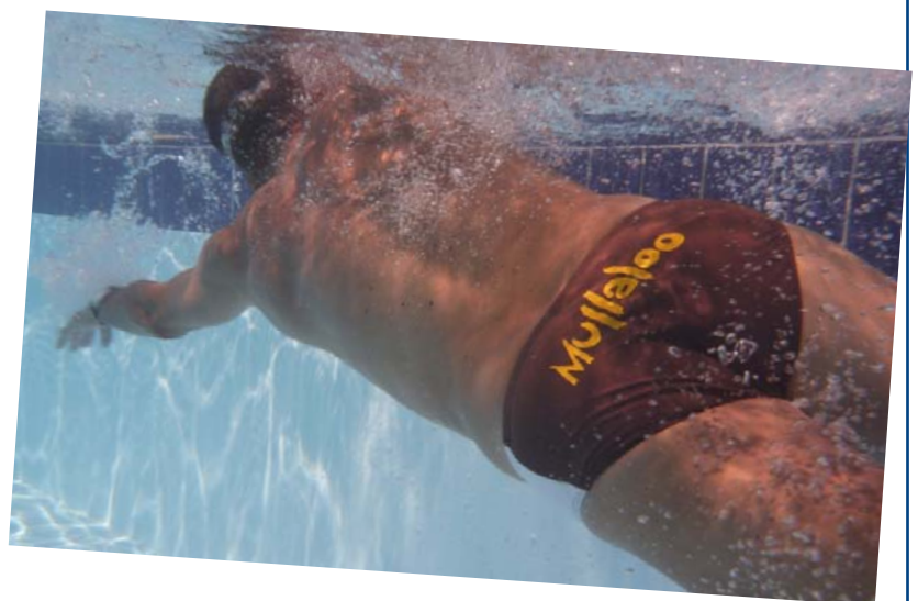
“brown floater seen in Gin Gin pool”

The success of the Brown speedo last season was astounding. Thank you for having some fun with our history.