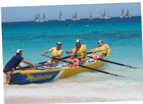
Mullaloo 'Tonners' get away.