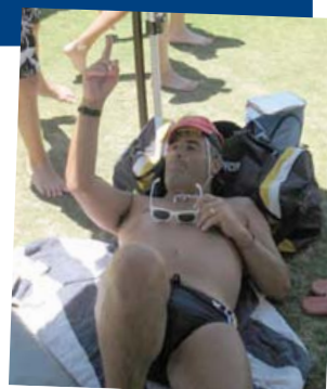
The exhaustion sets in.

Great day on the beach had by all, thank goodness for the sea breeze at 11:24am. Congratulations to all the competitors and a big thank you to all the officials, water safety, parent helpers, Age Group Managers and Liaisons.