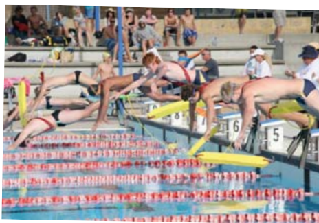
Start in the Pool Rescue.

This year SLSWA hosted the first of the Pool State Championships on 4 December at Challenge Stadium. This involves a series of rescue races held in the pool under International Life Saving rules. Mullaloo had a number of competitors at the carnival and dominated most events. Overall, Mullaloo won the day with 152 points followed by Trigg with 57 points. It was a great win for Mullaloo and a great start to our State Championships campaign. Well done to all of our competitors, a great Club effort.